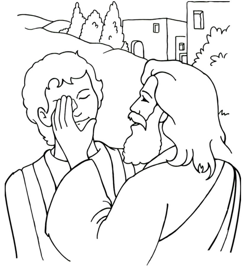
Jesus heals a blind man. John 9