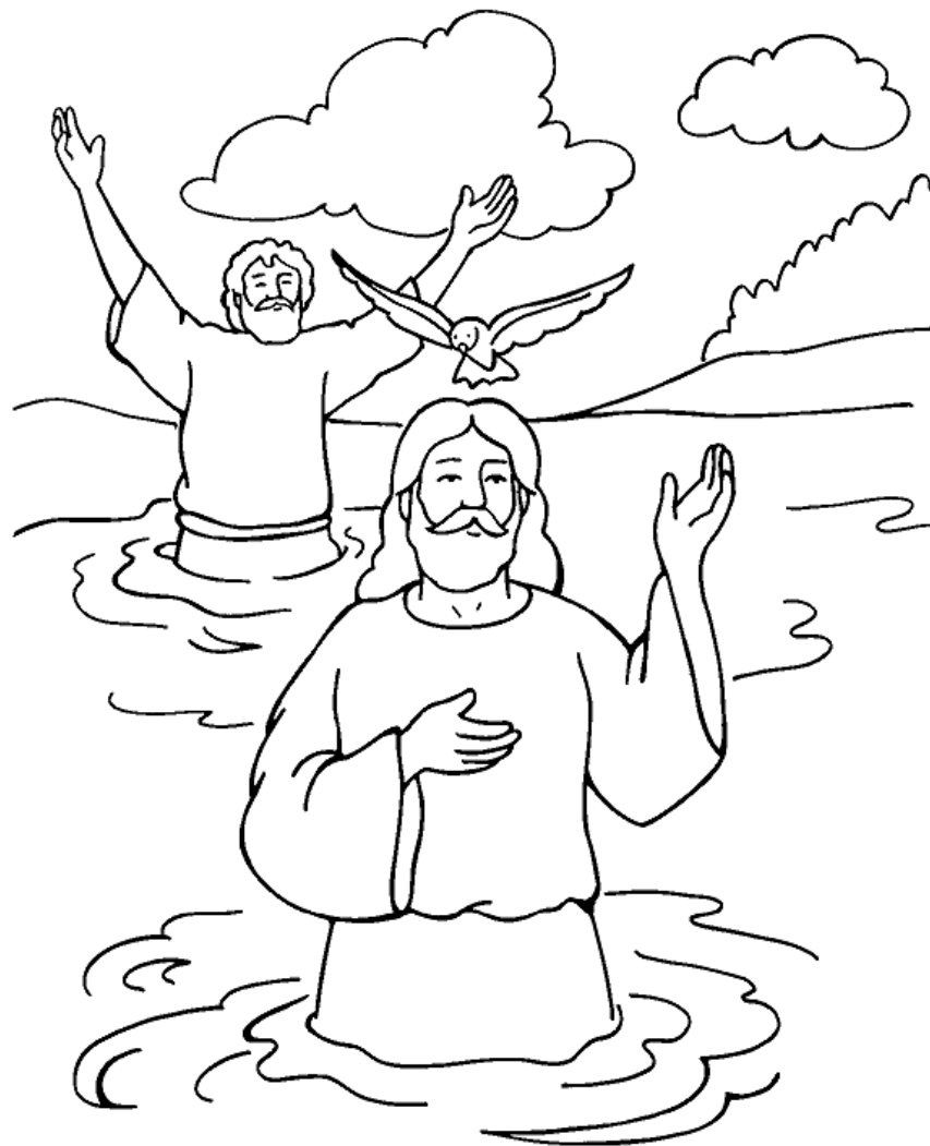
John Baptizes Jesus

From Thru-the-Bible Coloring Pages © 1986, 1988 Standard Publishing. Used by permission. Reproducible Coloring Books may be purchased from Standard Publishing, www.standardpub.com , 1-800-323-5473.