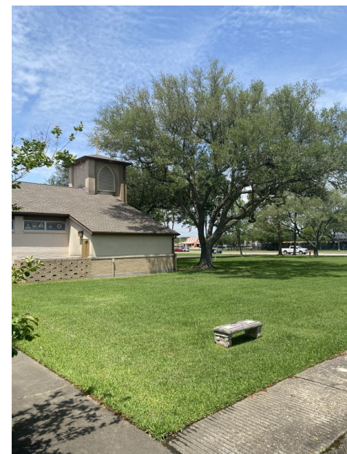
LOCATION OF THE NEW PLAYGROUND

In order to "advertise" to our community that we value children and children's ministries, we will relocate the playground to the northeast corner of our campus, next to the main parking lot and facing 518. The completion of the new playground is expected to be late summer/early fall, in time for the new school year.