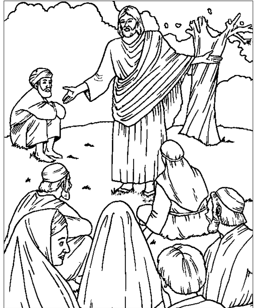
The Sermon on the Mount Matthew 5:1-12